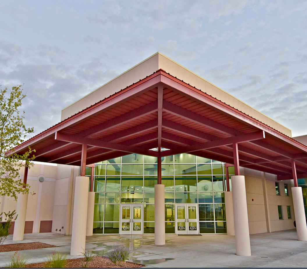
Clint ISD - Horizon High School - El Paso, TX