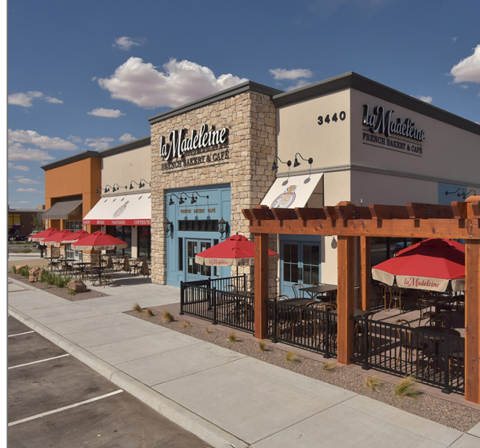
La Madeline - El Paso, TX