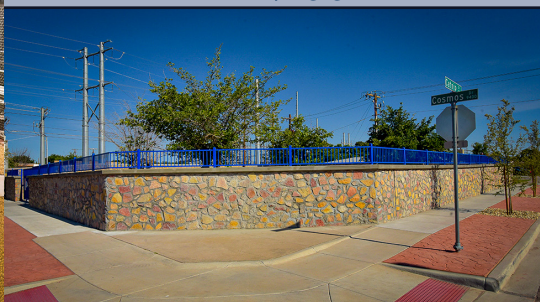
EPWU - #38 Wellhead - El Paso, TX