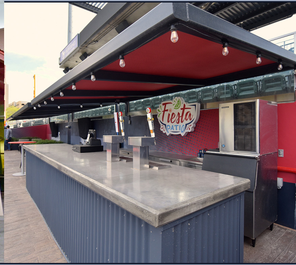
Locomotive Stadium - El Paso, TX