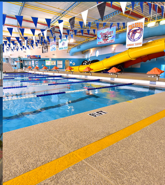
Socorro ISD - Aquatic Center - El Paso, TX