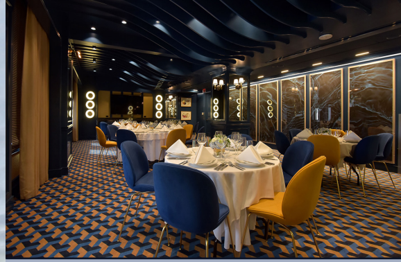
Anson 11 - El Paso, TX