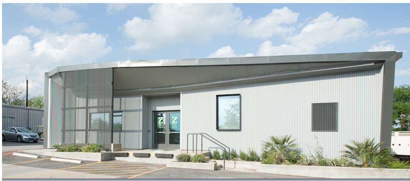
San Antonio Zoo - Animal Hospital - San Antonio, TX