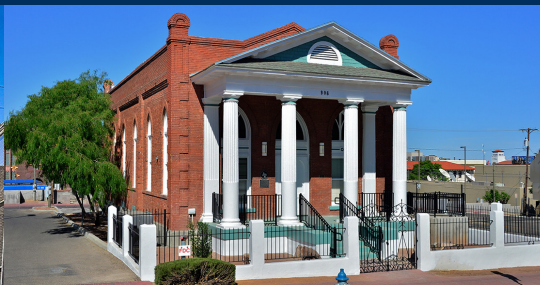
EPCC - Old B'nai Zion Synagogue - El Paso, TX