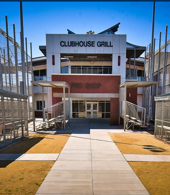
El Paso County - Sports Park - El Paso, TX